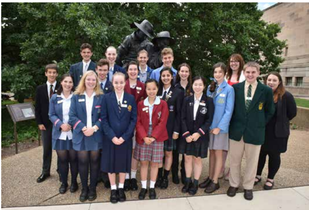
Winners and Runners-up of the 2016 Simpson Prize, with their teacher chaperones, at the Australian War Memorial, March 2016.