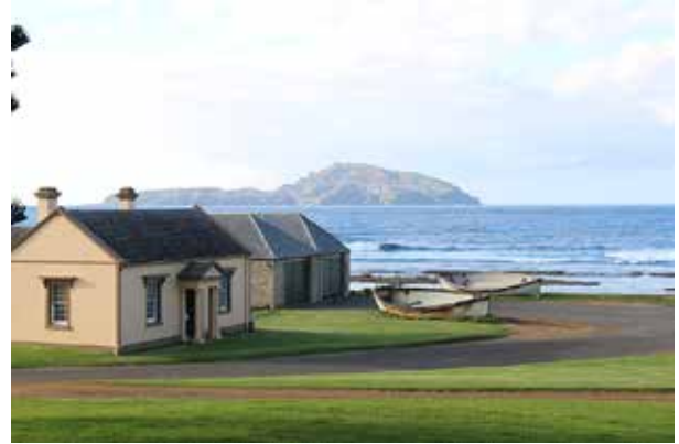
Norfolk Island, site of 'Paradise with a Past' conference.

We are delighted to report on the great success of our first 'offshore' conference, 'Paradise with a Past', held on Norfolk Island in January 2016 in collaboration with the Norfolk Island Central School. Over 50 delegates from all around Australia (except WA), along with many partners and families, enjoyed a feast of Norfolk and Pacific history, with lectures, workshops and guided tours focusing on Melanesian and Polynesian influences, convict settlements and the fascinating Bounty and Pitcairn history. A special feature was the 'Fletcher Christian Cyclorama', a moving artistic representation of the Bounty and Pitcairn narratives. There was plenty of time for swimming in Emily Bay and snorkelling out to the reef to see the colourful coral and tropical fish. If you plan a trip to Norfolk, do go with Rebecca Christian and her team at the Norfolk Island Travel Centre and enjoy a wonderful evening at the 'Jolly Roger', a newly opened bistro with musical maestro Matt Zarb to entertain you.